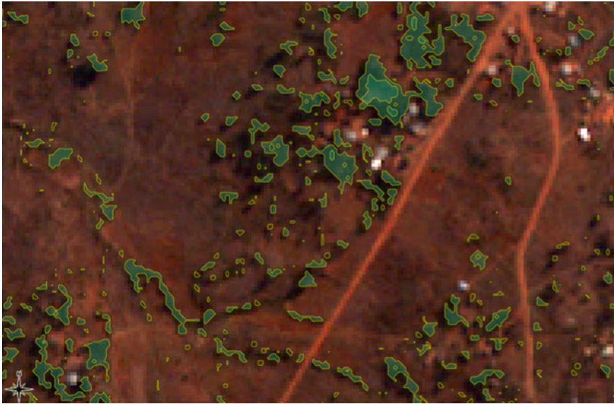
Fig. 6.2 Delineation of TOF crowns by remote sensing using sub-meter resolution Quickbird imagery (Gumbrecht unpublished)

resolution, it is not possible to identify trees and may lead to underestimation of biomass. Unfortunately, the price of the satellite imagery increases in parallel with the resolution and the specialized skills necessary to process the imagery limits many applications of this technique outside of the research arena at this time. Despite the challenges, crown area allometry is likely the most promising approach to transform our ability to capture information on aboveground biomass stocks, potentially for relatively low total costs in the future (Gibbs et al. 2007; Wulder et al. 2008).